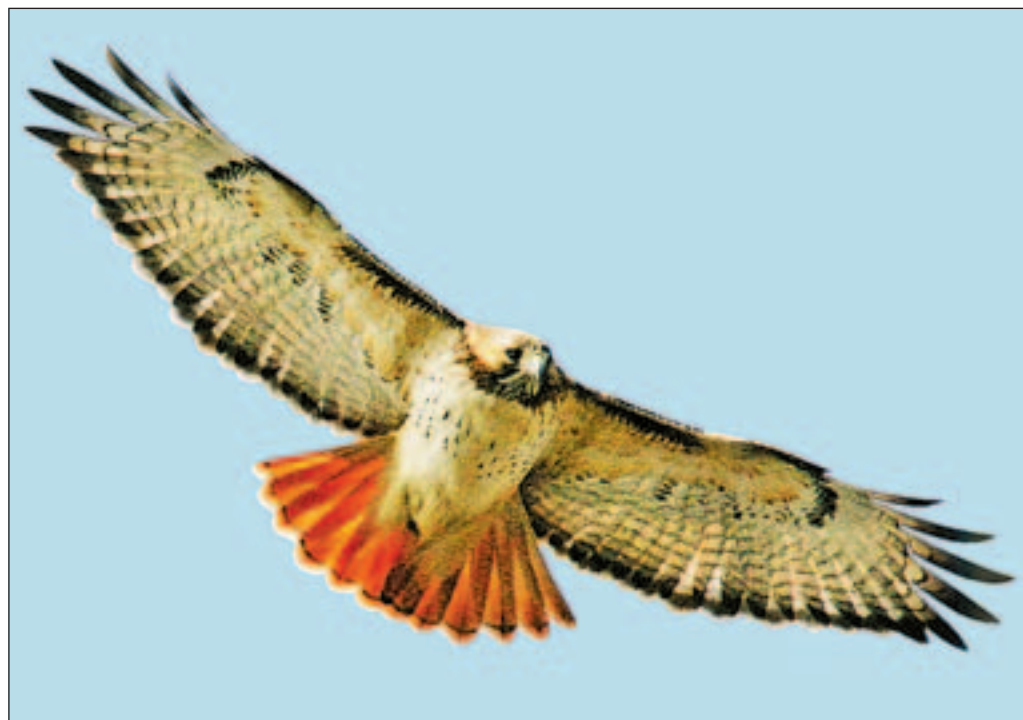
FROM BIRDS OF HAMILTON

It is sobering to revisit other disturbing examples of destruction during the Victorian era. Birds were exploited to decorate women's hats and regulations were weak and